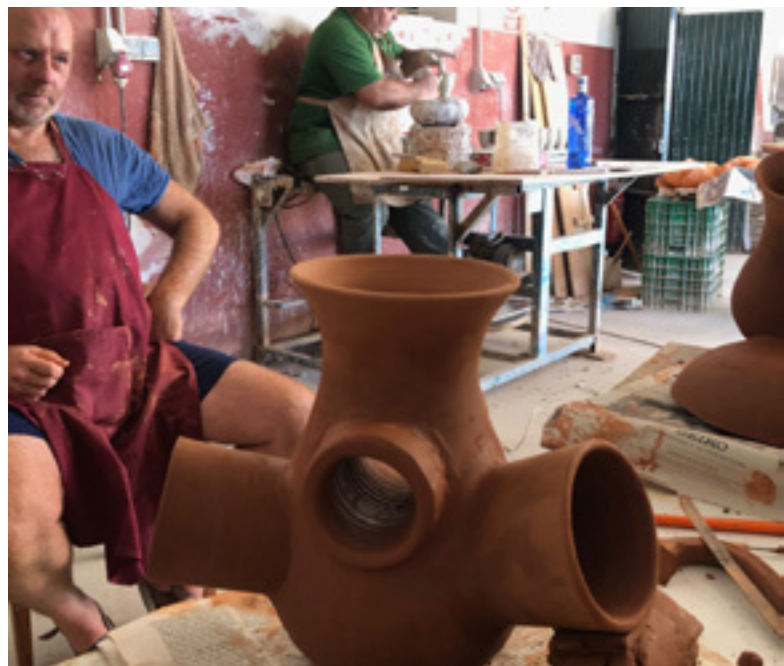
Experimentation and prototyping