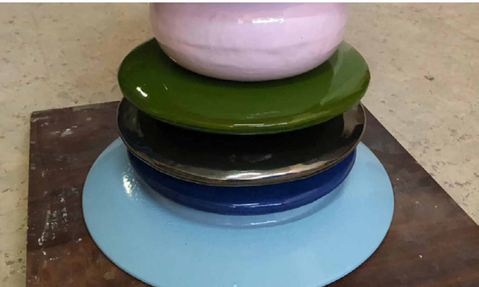
Design and development process of "Table with Re-molde"